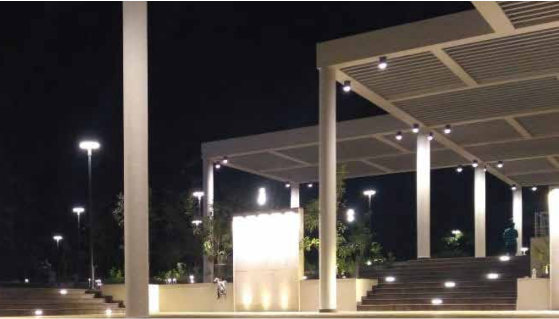
NITTE UNIVERSITY, MANGALORE