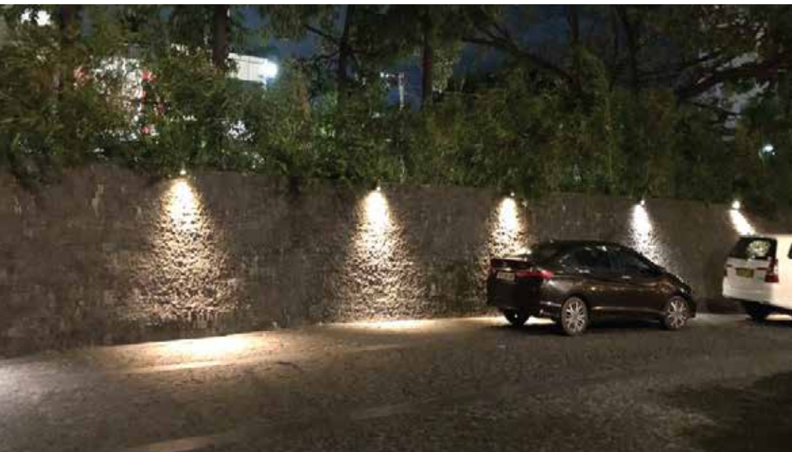
PARK HYATT, CHENNAI