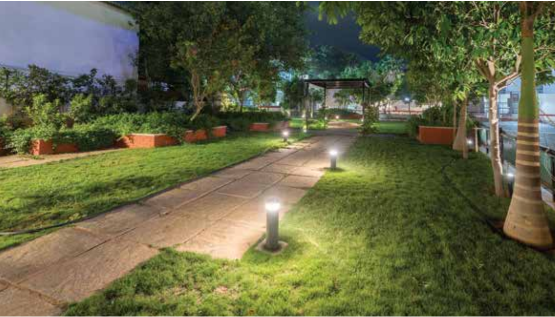
MGM HEALTHCARE, CHENNAI