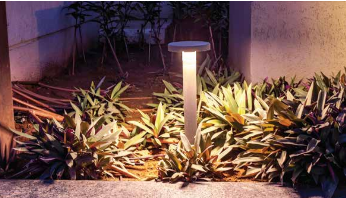
NCC URBAN ONE TOWER, TELANGANA